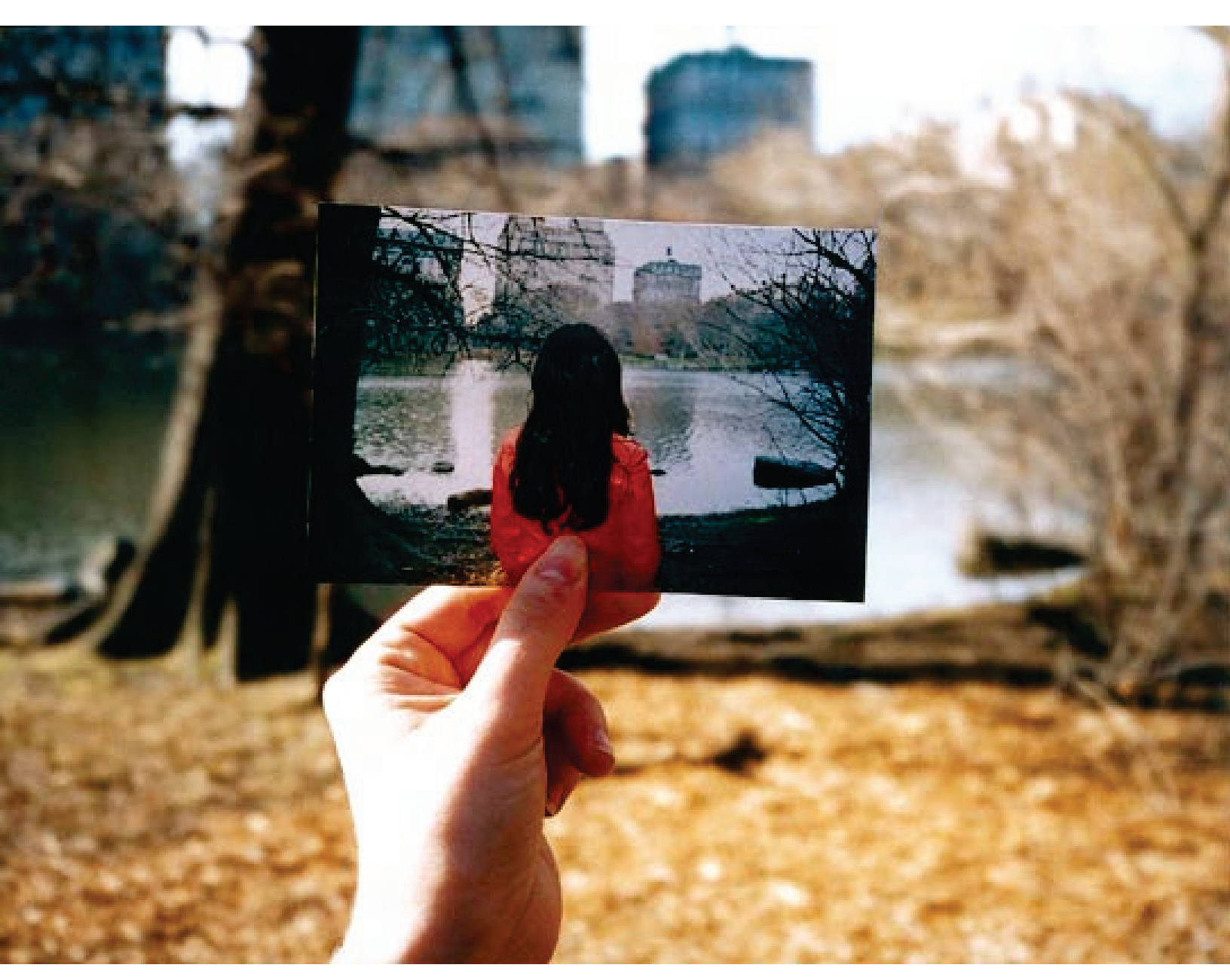
Figure 1 Janet Cardiff, Her Long Black Hair (2004). Permission to reproduce kindly granted by the artist and Luhring Augustine, New York.